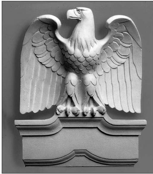
Sculpture - 10727 H. 18" W. 16" P. 5 1/2"

Cartouche: an ornamental tablet often inscribed or decorated; framed with elaborate scroll-like carving.